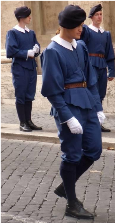
Figure 1: Everyday wear for the Swiss Guard. This photo is prewar as the guards are unarmed (although Beretta M12 or HK MP5s would be accessible).

the 2030s the dying archivist giving a cryptic clue to lost art or Vatican secrets became a staple of cheap fiction, especially when the Joshua Roll was discovered in the ruins of a train near Naples with the rear having about one metre of unknown characters assumed to be some sort of code that has not yet been deciphered.