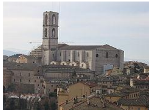
Illustration 5: The Basilica of San Domenico

In Perugia he has made the Basilica of San Domenico the new St Peter's (they share a large number of architectural similarities as they were both re-designed and renovated by Carlo Maderno) and the remains of Pope Benedict XI housed there have become a major source of pilgrimage for Italians. The Università degli Studi di Perugia (University of Perugia) has become a major site for Catholic scholars and teams are regularly sent south to Rome's Catacombs in search of stored records from the Vatican (the Chief Archivist died in the nuclear attack and many of the storage site's locations have been lost). It appears that at least some archives have been found as at least some art work believed to have been in the Vatican have now surfaced in Perugia (these may however have come from a reported secret convoy spotted leaving using the underground railway just before Rome was hit). In