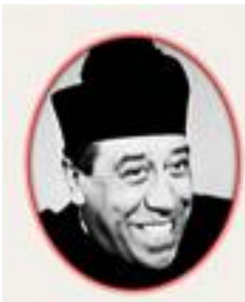
Illustration 3: Cardinal Camillo's official portrait 1995 (Vatican)

The strain of all the effort (including flights to Washington and Moscow) was too much for the ailing pope. In 1996 as a fake alert of a nuclear attack resulted in his flight by helicopter to the papal retreat at Castle Gandolfo, he suffered a major heart attack (the 1982 bomb shelter was not felt to be secure enough unless evacuation was impossible in the time available). Despite the best efforts of his doctor and the escorting Swiss Guard (including an ex-special forces medic) he was pronounced dead shortly after arrival.