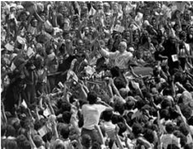
Illustration 1: Pope John Paul II visits Poland in 1979

When the Sino-Soviet War erupted the Pope tried to act as an intermediary. Links with the Orthodox Church were used but little was achieved. As the conflict spread to Europe the Catholic Church had more of an influence with the Poles in particular (Poland was the only Pact country that had a military chaplains department). Nothing was achieved but many worried Poles seeing the Polish Pope trying to promote peace turned to the church for solace.