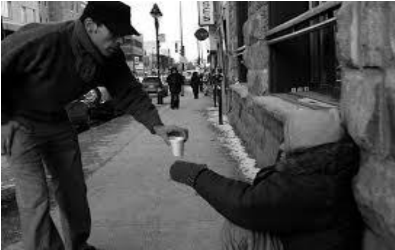
Illustration 4: Catholic staff distributing soup to refugees in Milan. This support has given Italians a stronger link to the Church than the fragments of the country.

Portrayals of Pope John provide an interesting contrast. To supporters he is seen as a stabilising influence on a shattered world and a leader of one of the few places where order can still be found. To detractors he is portrayed as an opportunist militarist who was betraying the spiritual legacy of the Church for temporal gain. His quiet non-public life prior to becoming pope leads to much discussion as to his character.